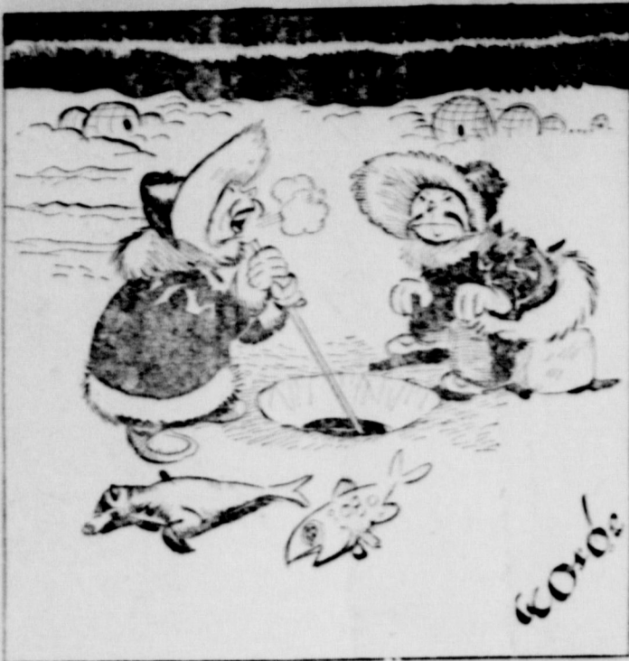
"I'd like to move somewhere away from all this. Every night Sputniks flash across the sky. Yesterday one of them atomic submarines scared away all the seals!"