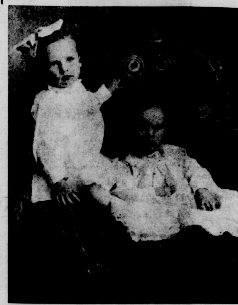
What's Your Guess

Does this young fellow look like any prosperous businessman you know in Wheeler. They are both cute but we are only interested in the boy, since his big ton gymnasium. sister doesn't live in Wheeler.