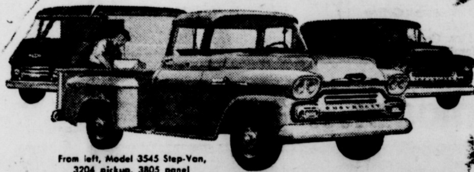
From left, Model 3545 Step-Van, 3204 pickup, 3805 panel