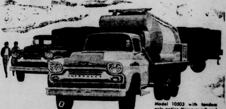
Model 10503 with tandem axle option (foreground) and Model 10203 chassis-cab

The heavy-duty Spartans make hauling history with the most revolutionary truck engine in decades—the Workmaster V8 with Wedge-Head design! Featured on high-tonnage heavyweights, this completely new 230-h.p. power plant achieves a new high in efficiency! Your Chevrolet dealer is eager to show you many other advanced features, including Triple-Torque Tandem options that boost GCW ratings all the way to 50,000 lbs.!