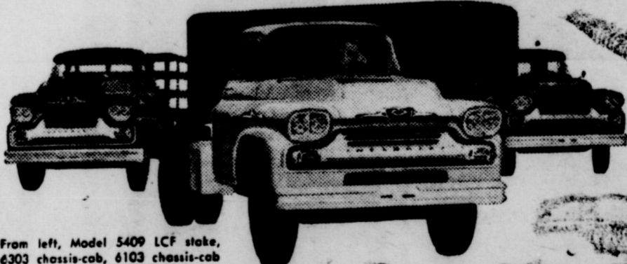
From left, Model 5409 LCF stake, 6303 chassis-cab, 6103 chassis-cab