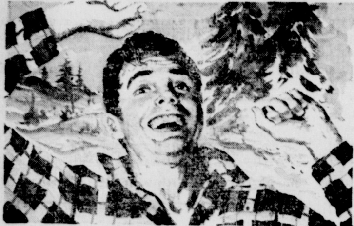
"Man! That Grand 21 year old feeling!"

Perk up your pep, fast! If you feel "Borderline Fatigue"—see what Bexel Special Formula Vitamins will do—only 6¢ a day!*