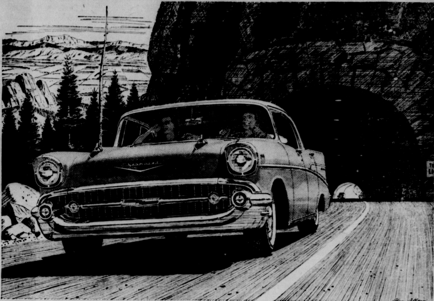
Beauty in motion—Chevrolet Bel Air Sport Sedan with Body by Fisher.

DON'T BUY ANY CAR BEFORE YOU DRIVE A CHEVY . . . ITS BEST SHOWROOM IS THE ROAD.