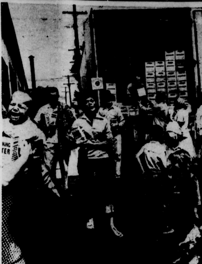
PURE WATER is distributed in a typical scene duplicated many times in the flood-ravaged areas of eastern Kentucky, Virginia and West Virginia. To meet the recent flood situation which had cut off 10,000 families from drinking water supplies, four dairy firms put their eight plants to work preparing 60,000 gallons of safe water in cardboard milk cartons and milk tank trucks. It was the first time the Federal Civil Defense Administration's plan for emergency water distribution had been put to practical use in a disaster.