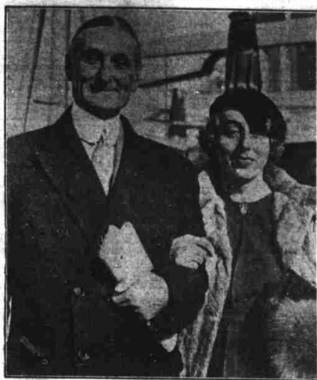
they arrived in New York when they returned from a short tour of Europe. The senator visited Russia during his sojourn and called the move of President Roosevelt to resume trade relations with that country "very wise, indeed,"