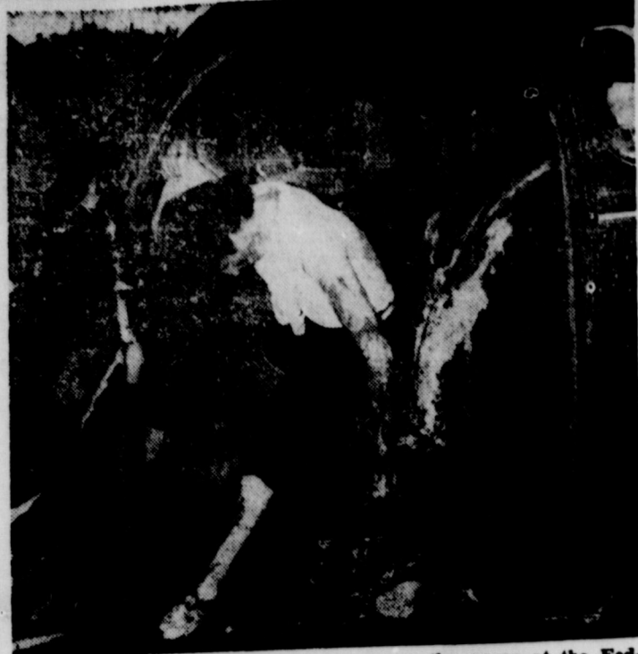
'BOMB-BATTERED' autos are among the props at the Federal Civil Defense Administration's famed rescue school at Olney, Md. Volunteer "victims" usually are Federal employes from nearby Washington, D. C., simulating, in this case, a typical scene in a higher damage area at the outer edge of a city.