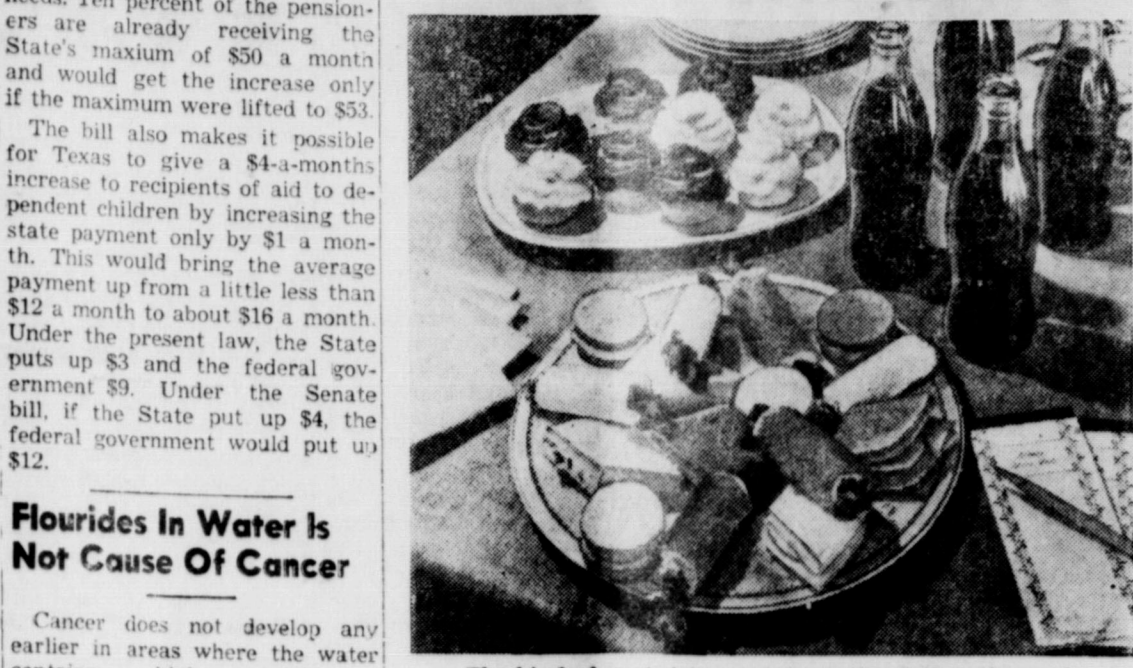
The kind of sandwiches and drink that follow the cards.