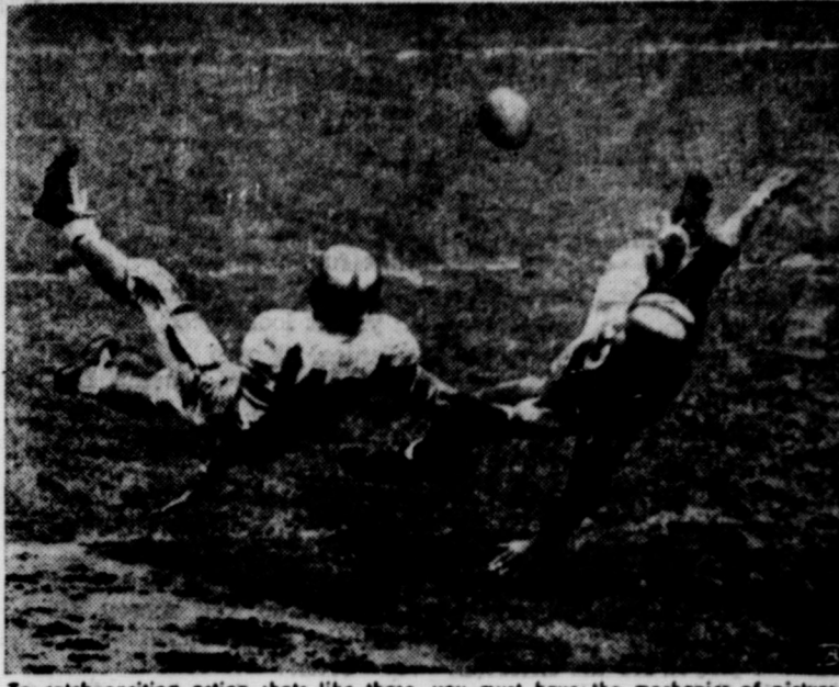
down put so you can concentrate on the in the Graffex Photo Contest by Fred Must.