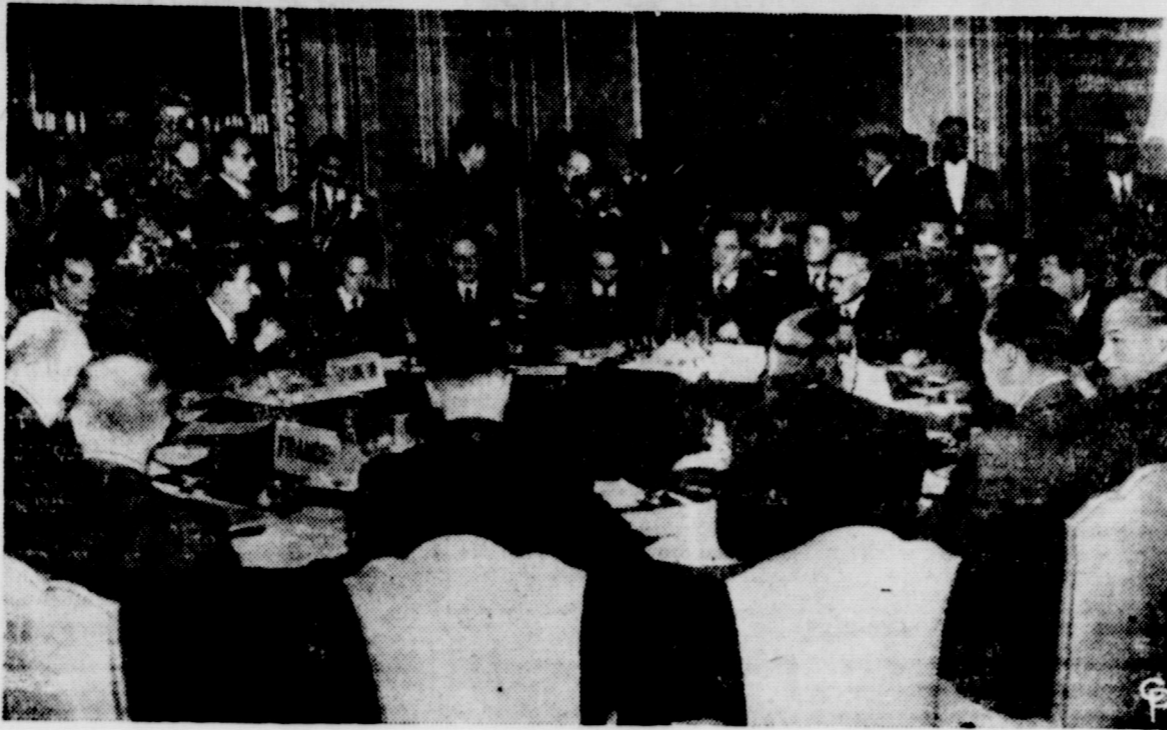
REPRESENTATIVES OF THE BIG FOUR nations open discussions in Paris on the fate of Italy's former African colonies. Shown at the round table are: Hector McNeil (extreme left), Britain's Minister of State in the Foreign Office; Russia's Deputy Foreign Commissar Andrei Vishinsky (center, leaning forward with glasses); Lewis Douglas, representing U. S. Secretary of State Marshall, and (left, back to camera) French Foreign Minister Robert Schuman. Only 3 days were allotted to the conference.