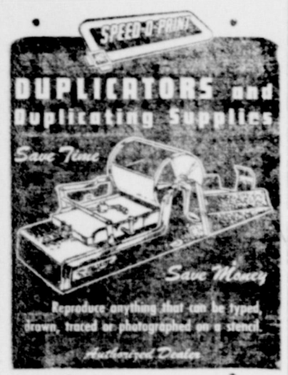
THE WHEELER TIMES WHEELER, TEXAS

It's a good idea to have a convenient spot in the kitchen for the roaster, preferably a stand or table of comfortable height near