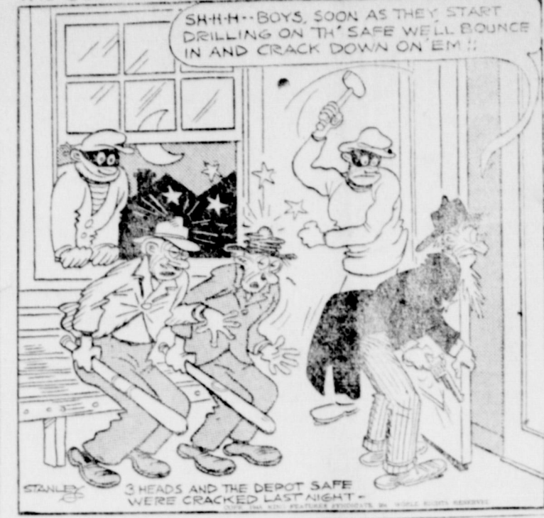
3 HEADS AND THE DEPOT SAFE WERE CRACKED LAST NIGHT.