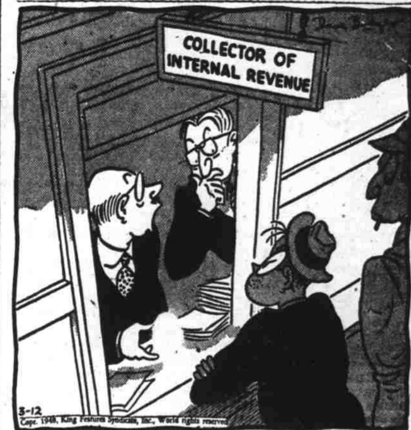
"He claims that since he had NO income last year, we OWE HIM the $500 exemption for his wife!"