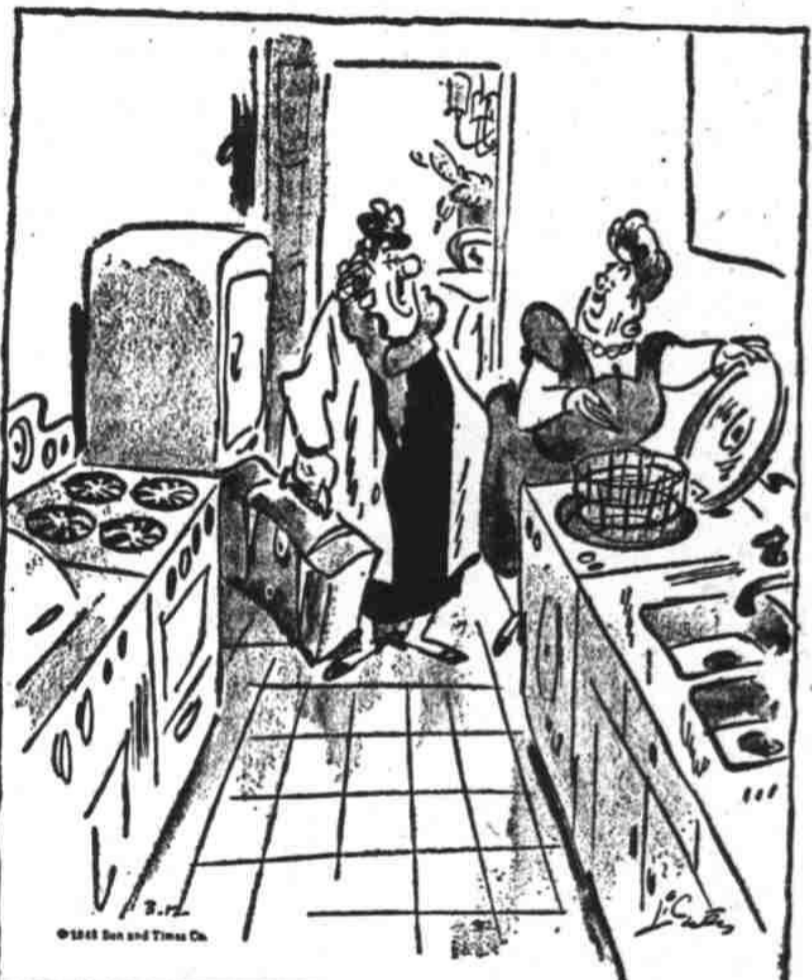
"Short hours and ideal working conditions is fine — but what plans have you made for me long hours of leisure?"