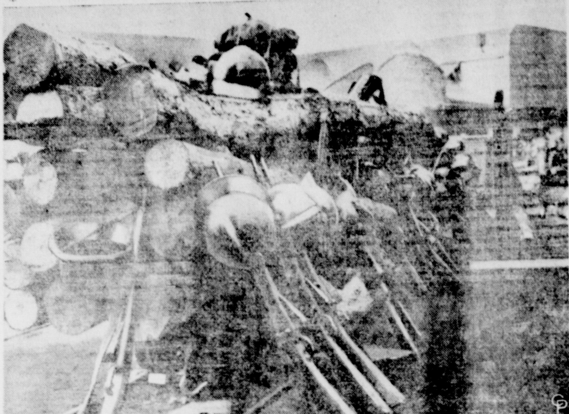
HELMETS OF FRENCH TROOPS are stacked outside the Villiers mine in the St. Etienne, France, coal area, indicating that it has been officially taken over by government order. Seven mines in northern France have been occupied as the miners strike situation became critical. A general strike in the city of St. Etienne is threatened and officials fear violence following the funeral of a miner slain during a demonstration