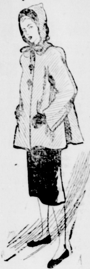
Green woolen topper.