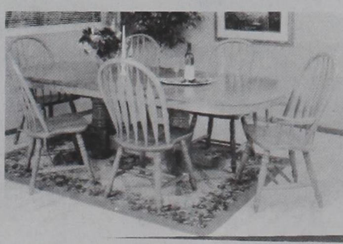
Table & 6 Chairs $499

A-AMERICA Solid Oak Table with Two Self Storing