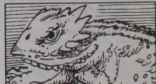
The horned toad is actually a lizard.

For more information or to register for any of the above events, please contact the rodeo office at (806)669-0434.