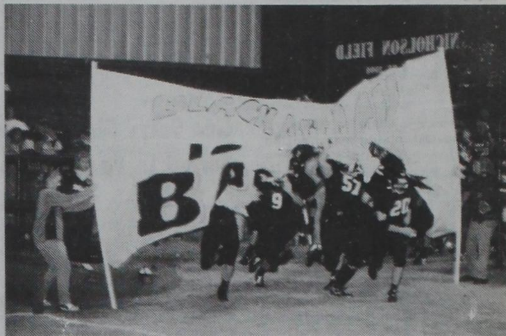
The Mustangs enter Nicholson Field for the last home game of 1999