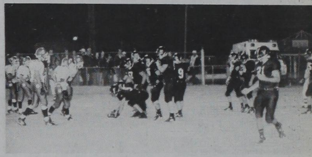
Wheeler Mustangs line up for their last play on Nicholson Field

To keep molasses, corn syrup or honey from sticking to a spoon or measuring cup, rinse utensil with hot water before using.