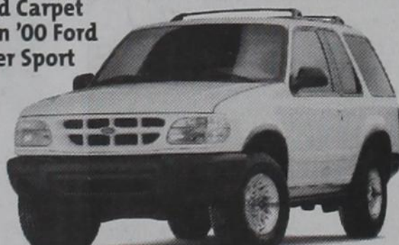
FORD EXPLORER SPORT†

$299/mo. 3-year, 36,000-mile Ford Red Carpet Option on '00 Ford Explorer Sport