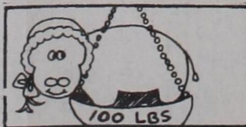
A hippopotamus weighs about a hundred pounds at birth.