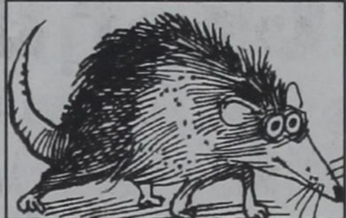
The common opossum is the only marsupial found north of Mexico.

Spring ... is almost here! We have what you need... Kites Wildflowers In A Can Hyacinth Kits Self-Contained Table Top Water Fountains Foliage Planters Puzzles