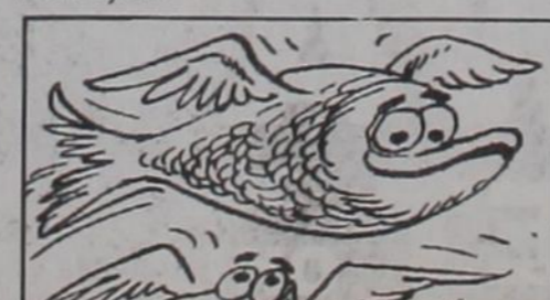
The flying fish can soar up to 1,000 feet.

The Soldiers had order to shoot first and ask questions later when they met Indians. It is interesting that One Eye determined that his word as a Cheyenne not be broken even threatened to join with Wynkoop if the Dog Soldiers started trouble following the death of Lean Bear in 1864. He visited Washington as a sub chief in 1863 with White Antelope. He carried the letter from Black Kettle to Fort Lyons before the massacre. He was placed in the guardhouse at Fort Lyon. He was also killed at the Sand Creek Massacre. One of his daughters had married a white man and lived near Fort Lyon.