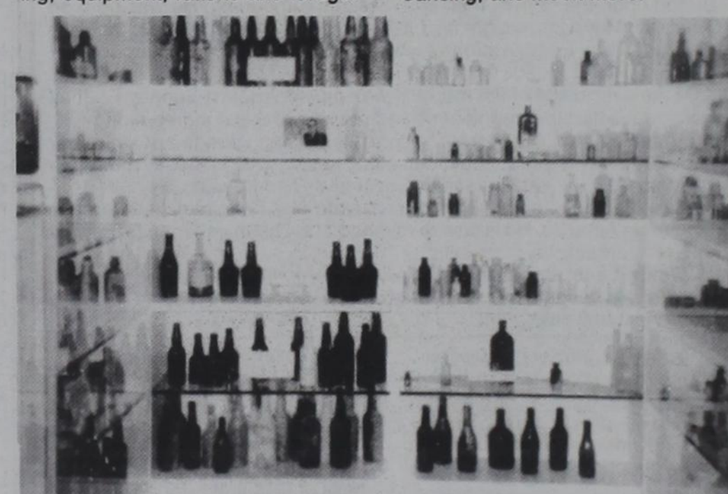
BOTTLES: This display at the Old Mobeetie Museum is well lighted to show between 100-200 bottles the museum has. The bottle collection are a few unearthed in and around Mobeetie and the Ft. Elliott areas.

The average cavalry trooper weighed 140 to 150 pounds, and even when he was stripped down for action, he burdened his horse with 100 pounds of indispensable clothing, equipment, rations and forage.