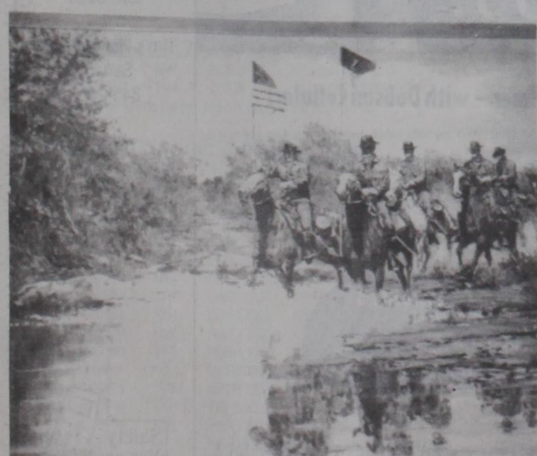
TITLE PANEL: This painting by Kenneth Wyatt greets the visitors at the Old Jail Museum in Mobeetie. The 6'x8" painting was purchased by the Old Mobeetie Texas Association as a permanent hanging at the museum. The work is entitled "Crossin' the Sweetwater" and depicts the 7th Cavalry expedition lead by Colonel George Custer making a crossing in the Panhandle in 1868. At a later date, copies will be offered in three sizes.