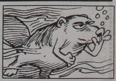
A beaver can hold its breath for 15 minutes and swim underwater for half a mile!