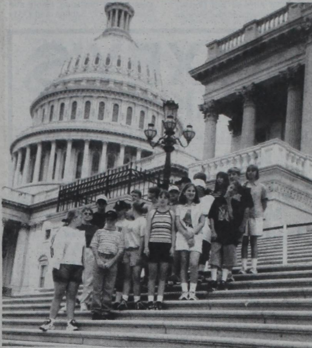
TRIP TO WASHINGTON D.C.: This group of youngsters recently returned from an educational trip to Washington D.C. A report on the trip can be found on Page 13. The students attending are named in the story.

Dear Dad, I am glad you are my dad. I hope