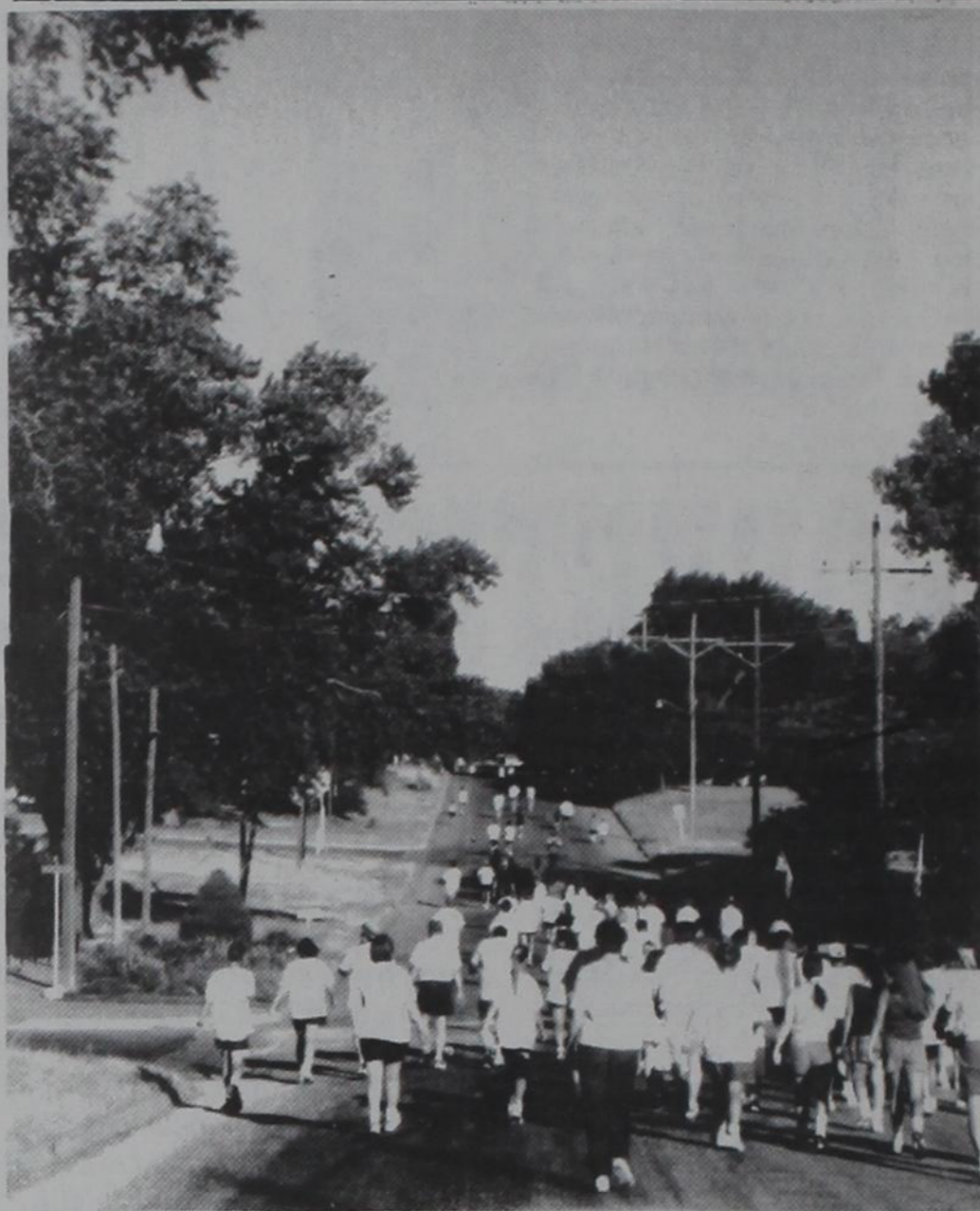
UNDERWAY: The annual Fun Run/Walk is quite popular with those in attendance at the 4th of July Celebration. The group is shown in the 400 and 500 block of South Mobeetie Street. Bringing up the rear is the photographer.

Listen to... KPDR-FM, 90.5 WHEELER, TEXAS