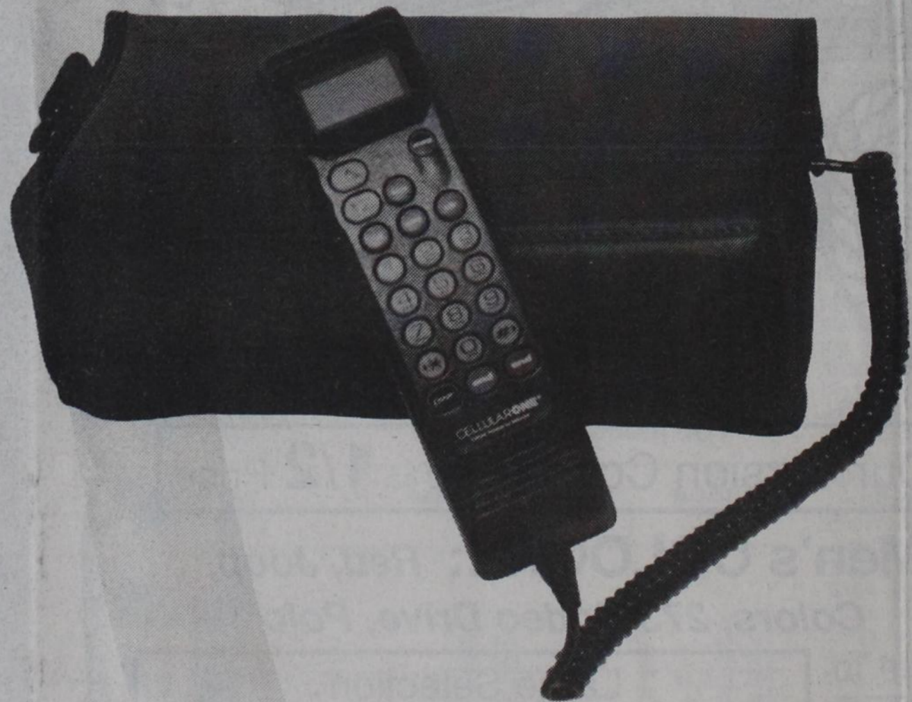
Motorola Shoebox Bag With Battery -- $29.95

+ NO 100 (Plus) ... NO Activation Fee and ... 100 Bonus Minutes!