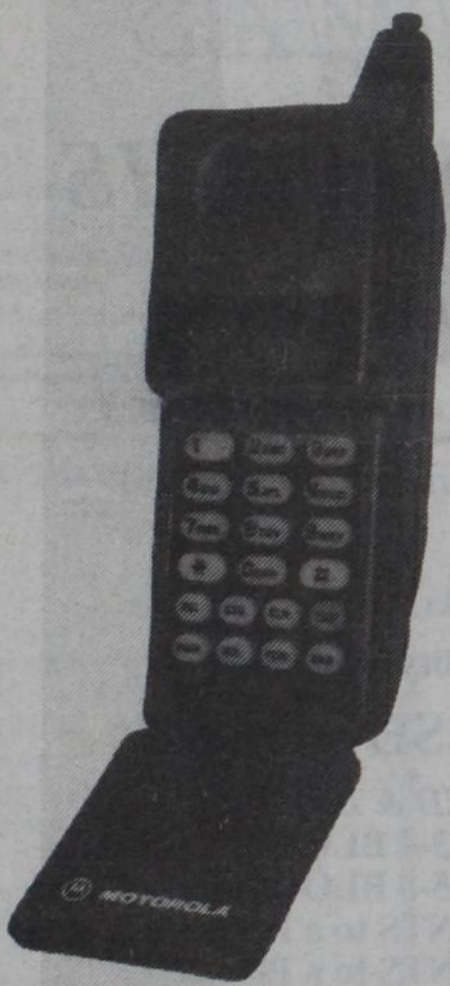
Motorola 550 Flip With Starter Kit -- $19.95