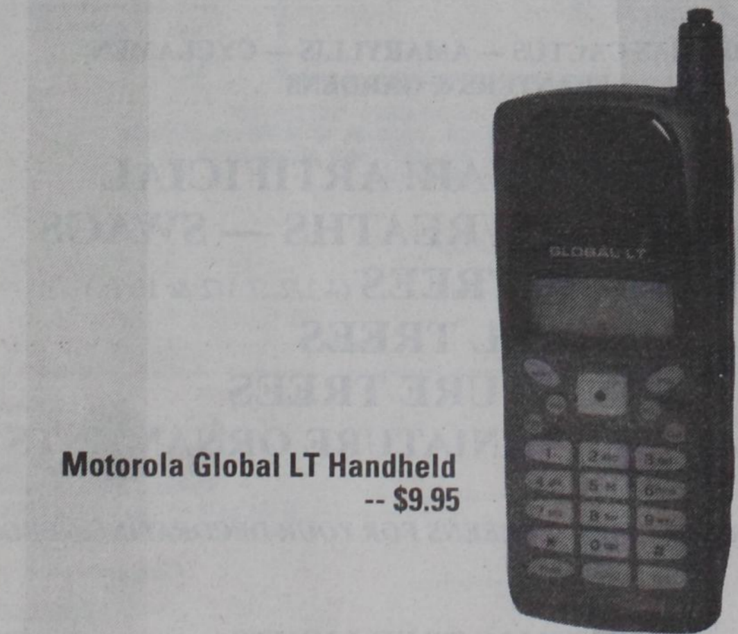
Motorola Global LT Handheld -- $9.95