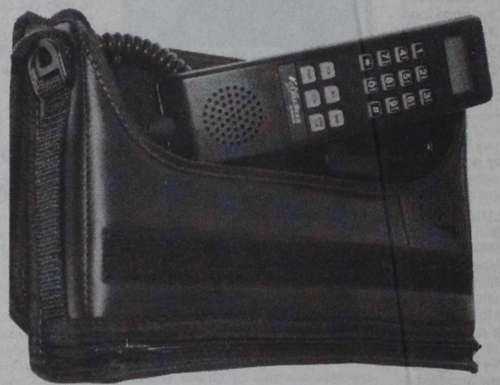
Motorola Tote with Battery -- FREE