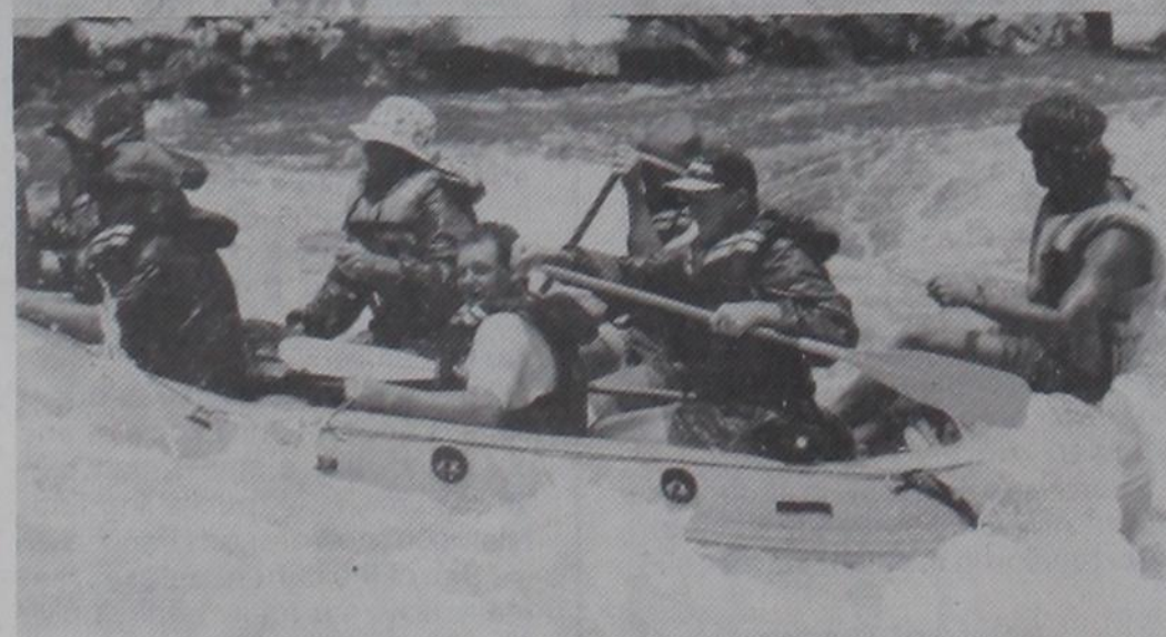
This set of pictures shows the Wheeler Scouts of Troop 472 and their adult sponsors shooting the "Sunset Rapids" at the end of the Rio Grande Box Canyon at Taos, N.M. The troop raised the money for the trip through the sale of locally made tow ropes and other projects.