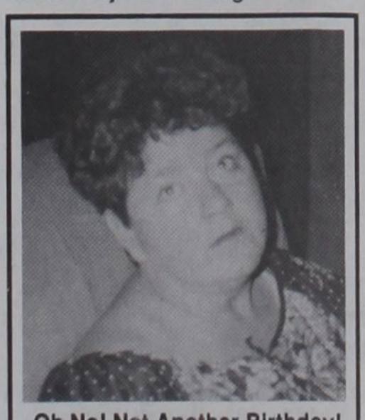
Oh No! Not Another Birthday! Love Always, Your Little Niece, Your Darling Daughter & the rest of the gang

February 14 - February 18, 1994 Monday: Hamburger Casserole, yellow squash, potatoes, butter, toast, cake, milk. Tuesday: Enchillidas, corn, salad, banana pudding, milk. Wednesday: Ham, sweet potatoes, peas, hot rolls, grapes, milk. Thursday: Hamburgers, cheese, pickles, onions, lettuce, tomatoes, tator tots, ice cream, milk. Friday: Beef on a Bun, French fries, baked beans, onions/relish, fresh veggies, fruit, milk. Menu subject to change.