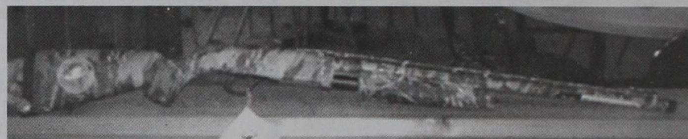
4TH OF JULY RAFFLE: To help pay for the fireworks display at the 4th of July celebration, the Wheeler Chamber of Commerce is raffling off a Browning 12-Gauge Shotgun and "A Day of Beauty." Chances for either of these is $5.00 each. The shotgun is a Browning 12 Gauge Shotgun Model: BPS MOBU NWTF DT 12-3 24+. The "Day of Beauty," a $300 value includes a facial, hair, manicure, pedicure, & massage—compliments of Shear Delight, The Purple Door, & Paradise Spa. The drawings for the shotgun and "Day of Beauty" will be held at the park, July 3, before the fireworks. For information, phone 806/826-3408.

1201 N. Hobart Coronado Shopping Center Pampa, Texas Phone 806.688.5370