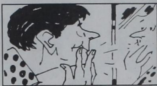
The first electric razor was marketed in 1931.