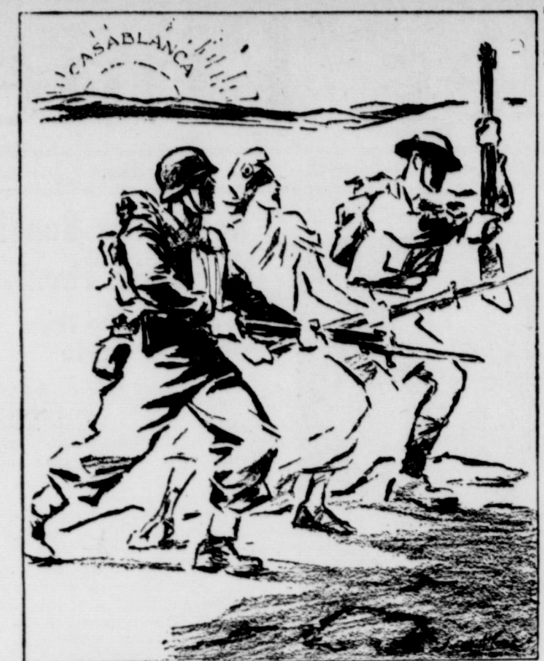
-Three On a Date-With Hitler!