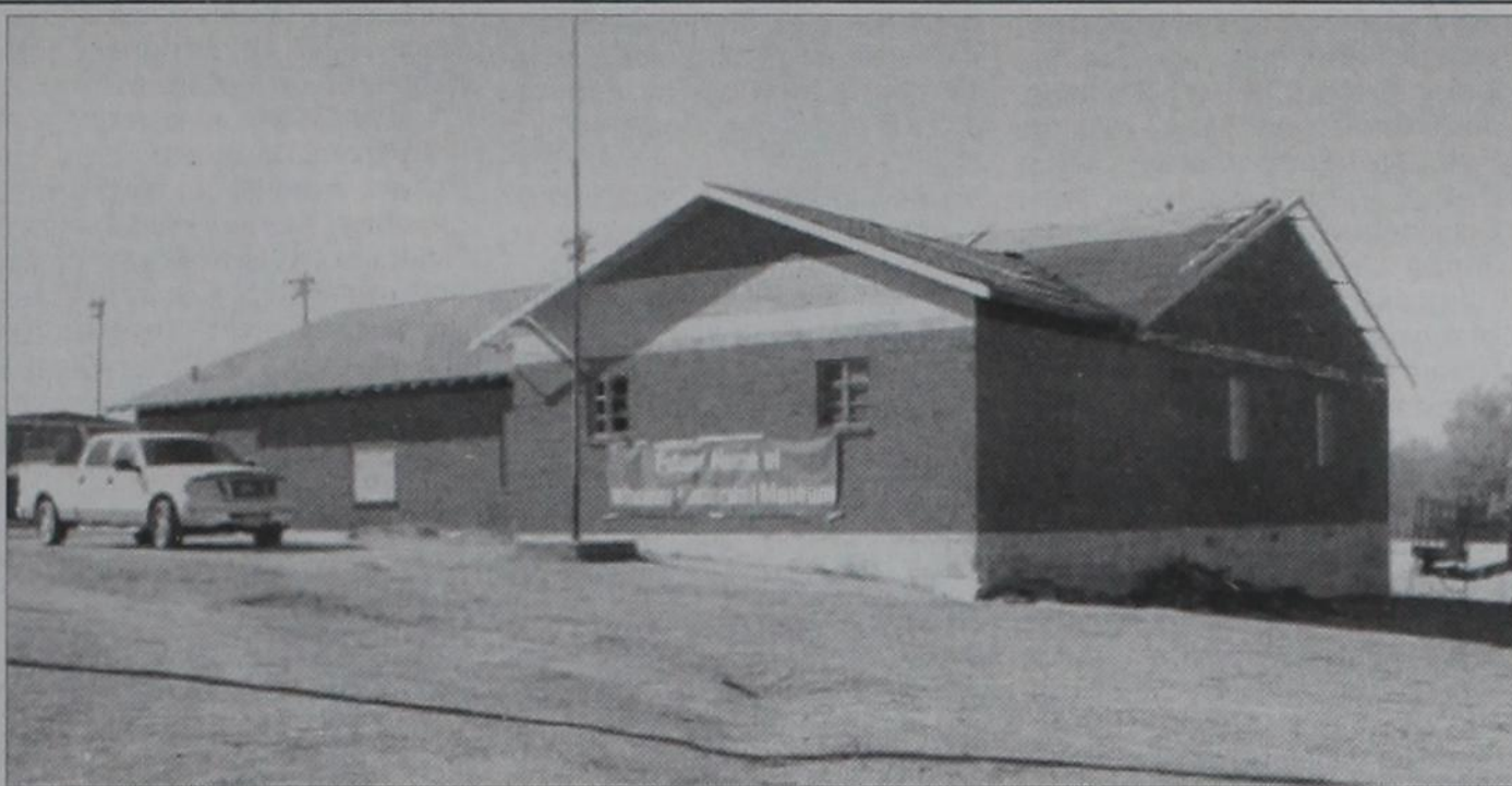
WORK BEGINS: Repair work has begun on the old American Legion building, the future home of the Wheeler Historical Museum. The first step in restoring the building is repairing the roof.

My Suzy dog was chasing Mason (dog). Mason ran to the dock, jumped on the boat and slid in the lake. We didn't see him. We called the dogs to come in and Mason wasn't there. We called and called. Then we saw Mason on the outside of the fence by the water. He saved himself and climbed on the dock by the boat. We saw the tracks in the snow and where he slid down the boat. He was wet and cold. He was so happy to be safe he ran and played in the snow. Then I took him inside and rubbed him dry with a towel. I'm so happy Mason is safe. That's it.