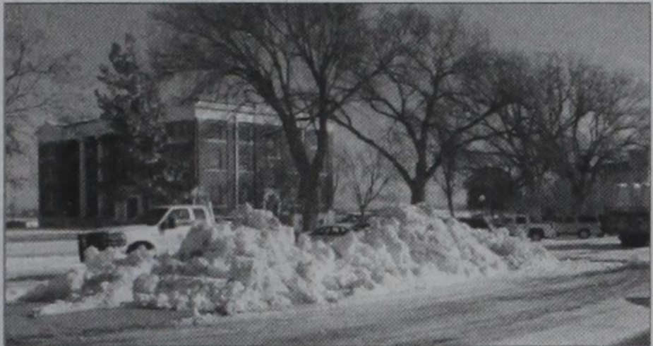
SNOW PILE: A pickup drives past the pile of snow at the west end of 100 E. Texas in Wheeler on Tuesday morning. The official moisture measurement was 2.03".