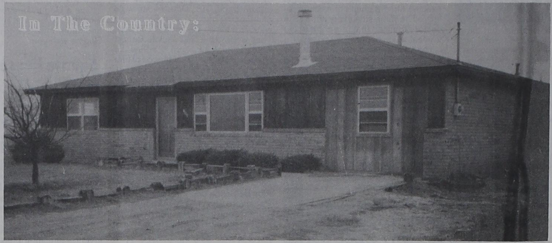
In The Country:

#110 Vaccant lot on south end of Alan L. Bean Blvd. #99 By the School. $5,000