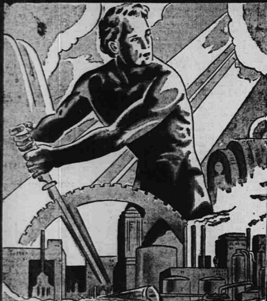
IT'S OUR 23rd ANNIVERSARY