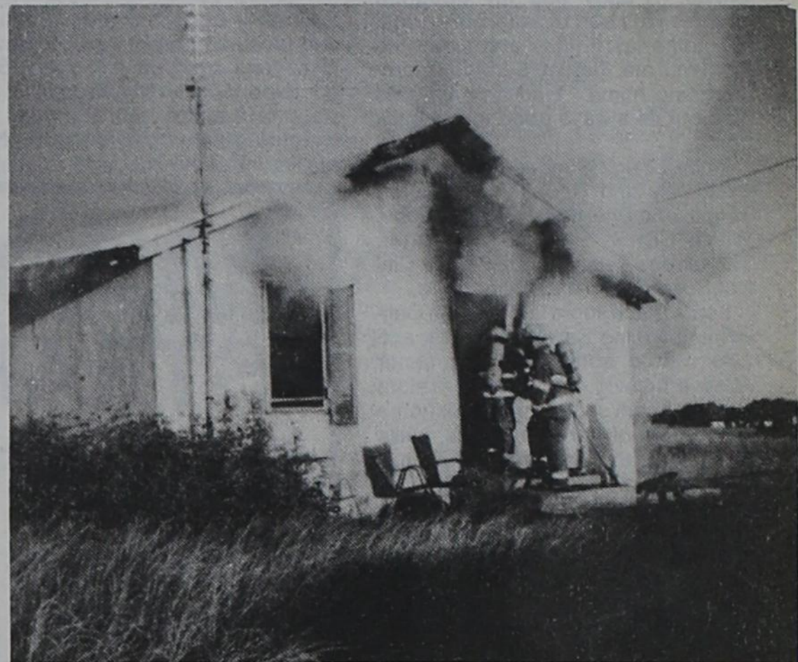
HOUSE FIRE: The Wheeler Volunteer Fire Department was called to a house fire in the Kelton area. The house was unoccupied; it was totally destroyed by the fire. The Wheeler Volunteer Ambulance Service was also on the scene and treated one fireman for smoke inhalation. The fire department and the Ambulance Service work together. The fire department responds to vehicular accidents and the ambulance service responds to structure and major fires.