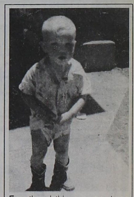
Even though this young man turns 40 in a few days, I know for a fact he still dresses this way! Love, Me