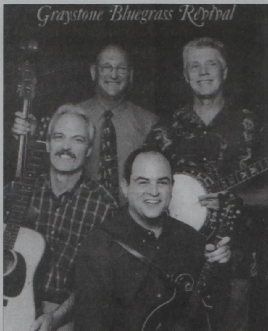
Graystone Bluegrass Revival

have church services next Sunday due to the gospel program at the campgrounds.