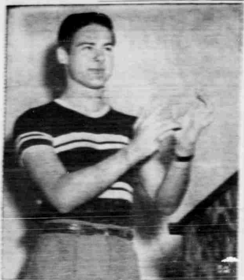
Bearder, II. demonstrates the age language he also in preach MIG TO THE HEAT HIS WORKS TALL STREET EARING THE SAMENING AND IN and general recipies to series of tark at general densities Stattern Burtier Home Western Board, He pecame deal at the age. # of force, but follows repairs place work of Baylor by his reading deal in Texas, Bearder is site of the ministern employed by the and the study of carbon most more by his classificies.