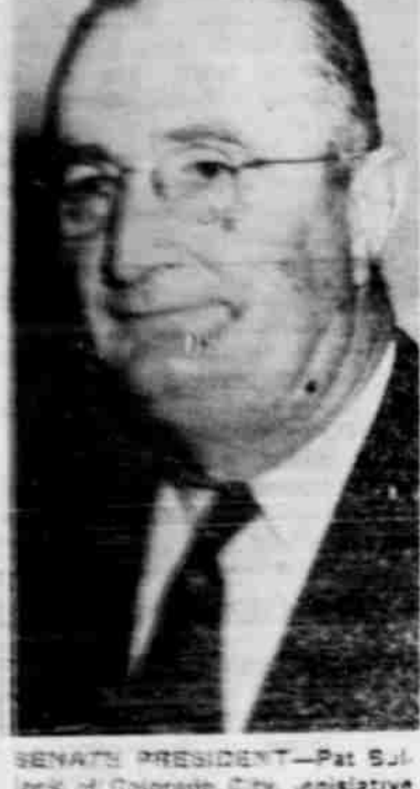
book of Colorado City, egislative