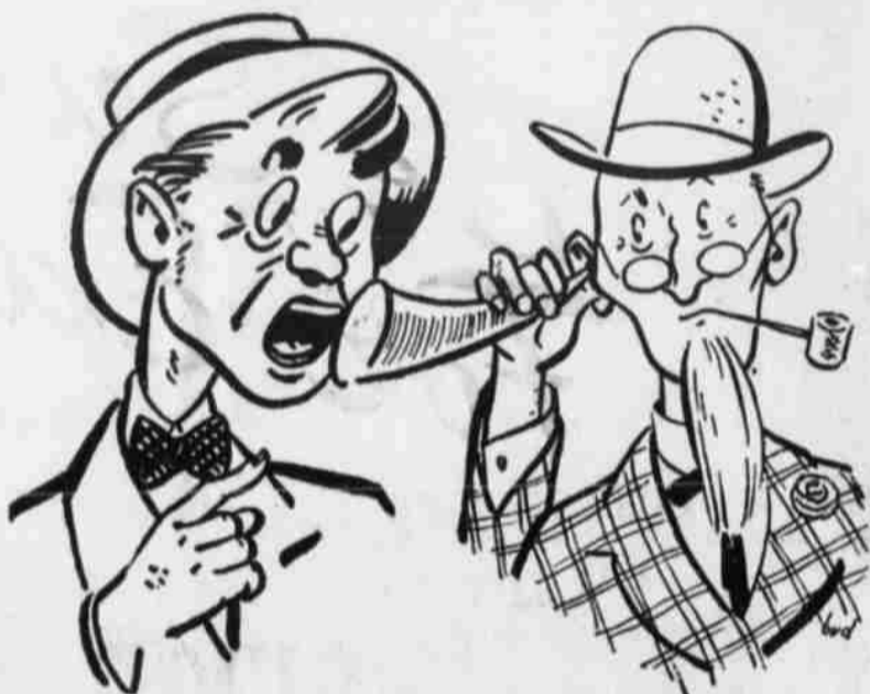
I didn't say "Minnesota" paint was heavenly! I said they've been making it since 1870. The Cameron stores sell it.