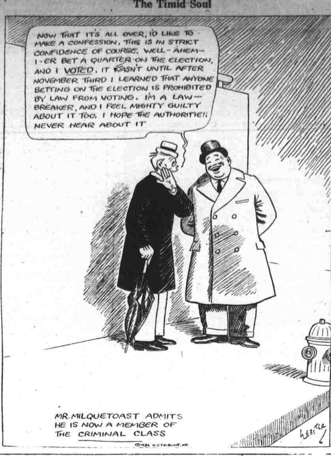
MR. MILQUETOAST ADMITS HE IS NOW A MEMBER OF THE CRIMINAL CLASS.

Complicity Lack of inquisitiveness on the part of the supreme court is causing some apprehension among law-justices.