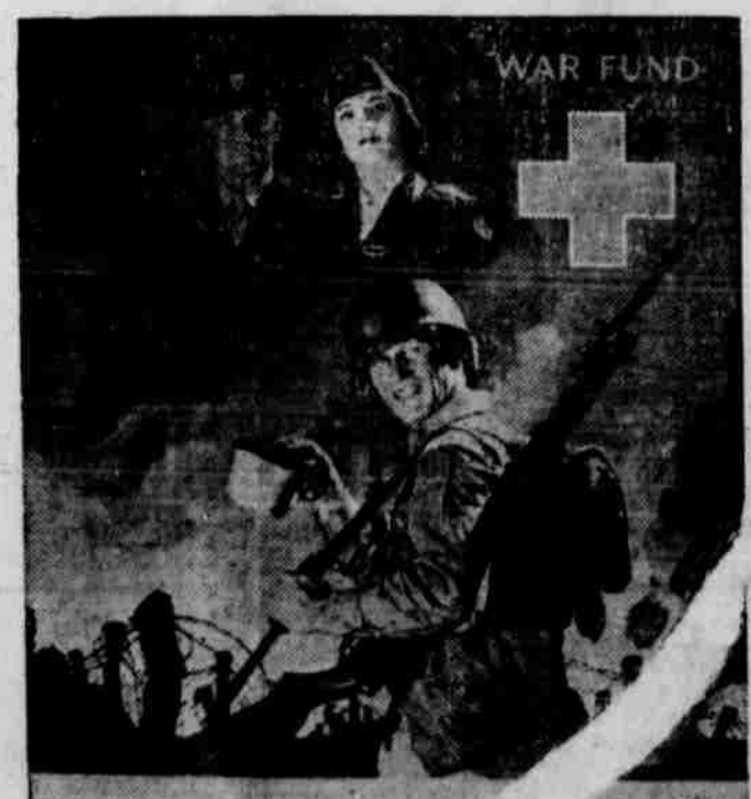
Your RED CROSS is at his side

Lamb County's Quota is $18,000 LET'S GO OVER THE TOP