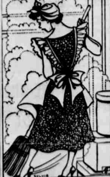
DON'T BE A DRUDGE ... knock yourself out with once-a-year house-cleaning. It's smarter to do a little every day.