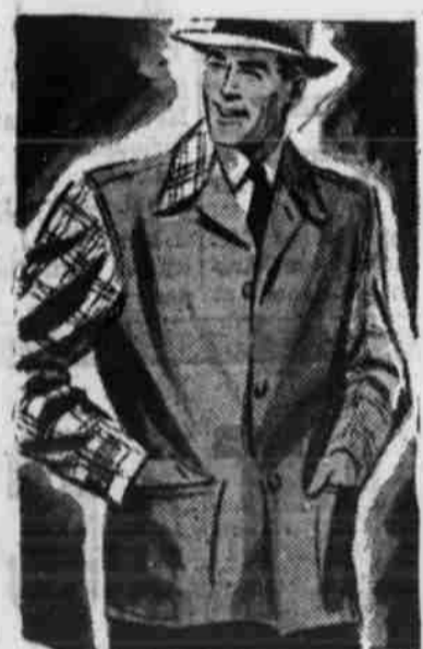
Leisure jacket with plaid collar, sleeves and back. 16.95

Rediscover your own backyard for having fun. Off-duty plaid shirts like this one will shine socially and double as "diggin' duds." . . . . . 2.95 to 5.95