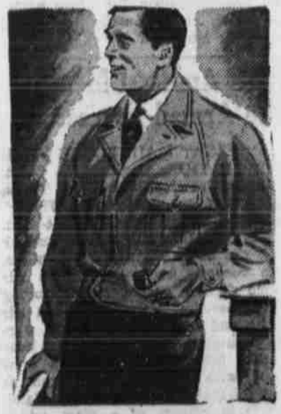
Popular battle jacket in wind and water proof poplin. . . . . 8.95