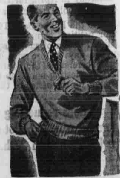
An all wool sweater. Several attractive colors. 5.00