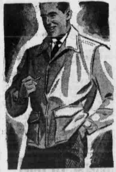
A water repellent jacket. Smart roomy patch pockets. . . . . 8.95