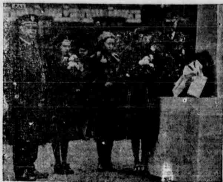
CLEVELAND, Ohio . . . This city recently took sorrowful inventory of its traffic dead as memorial services for the 114 victims of 1938 were conducted in Public Square. As spectators, including relatives of the victims, stood silently by, three young girls whose fathers lost their lives through automobile tragedies placed a green wreath on an obelisk on which was inscribed, "In Memory of Cleveland's 114 Traffic Victims, January 1, 1938-December 3, 1938."