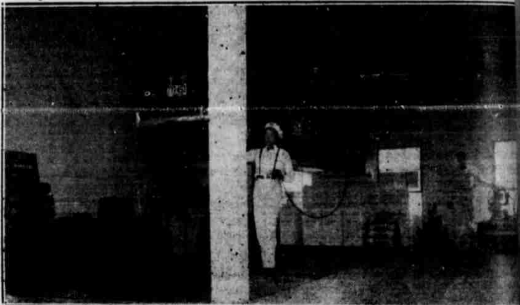
McCORMICK'S MODERN LUBRITORIUM

With modern car lift and equipment we are prepared to do perfect washing, polishing and waxing. Also vacuum cleaning of car interiors.