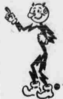
Reddy Kilowatt YOUR ELECTRICAL SERVANT

You may have to scour the town these days for common household items, for cigarettes, clothes, and many another article, but not for electric service! I'm as close to you as your nearest electric outlet — "The little man who's always there."