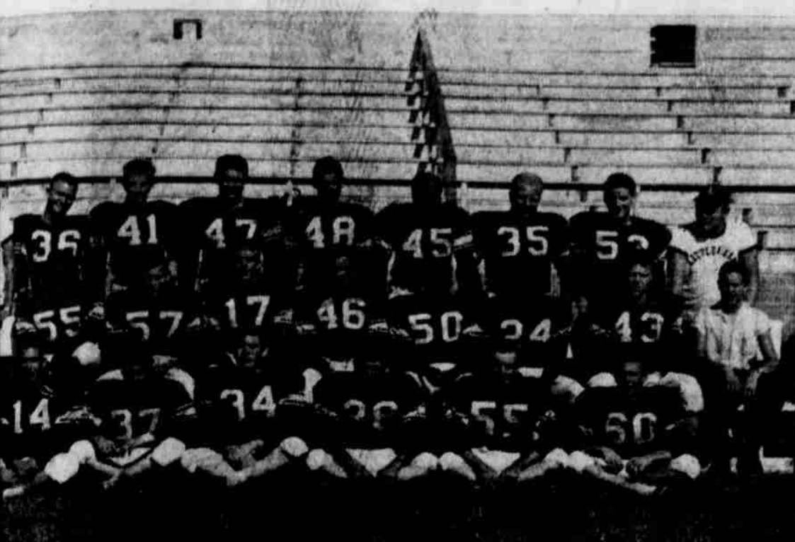
C A T B T E A M