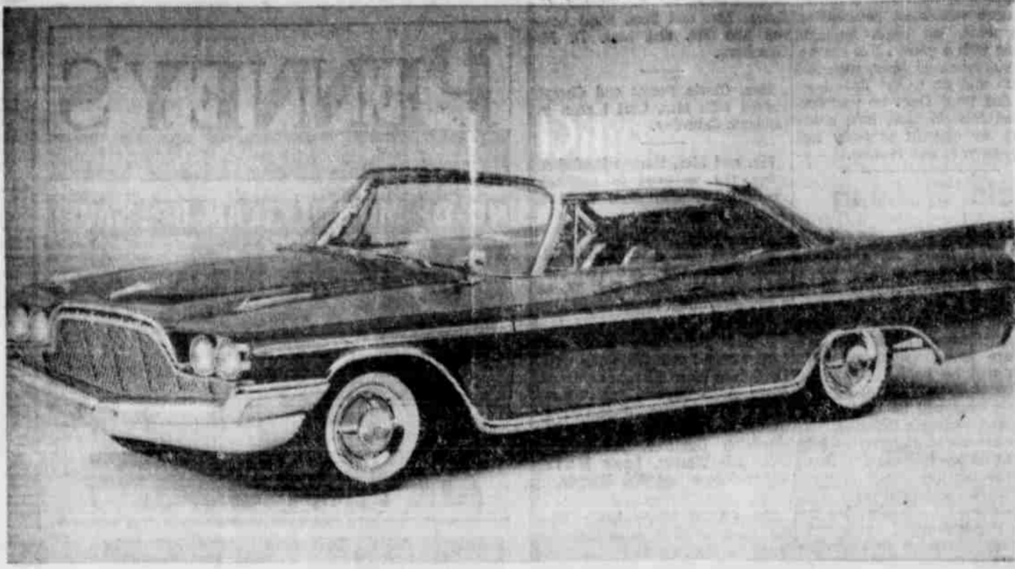
... The 1960 DeSoto, at Batson Motor Company's Showroom