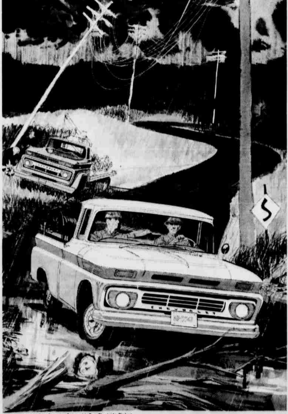
Above: 7-Ton Cab Chassis. Below: 1 1/2-Ton Fleetside Pickup.

It is the year's major joint test of the Atlantic Command's conventional warfare capabilities.