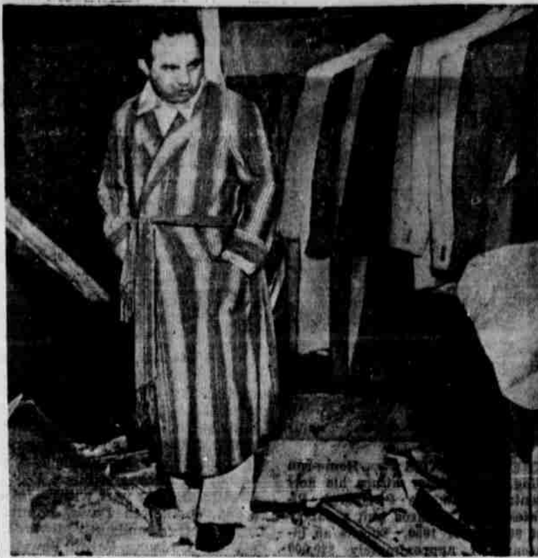
BLAST IT! . . . Mickey Cohen surveys damage to his home after his escape from death when a bomb ripped away part of the house. The bombing was the fifth attempt on his life.