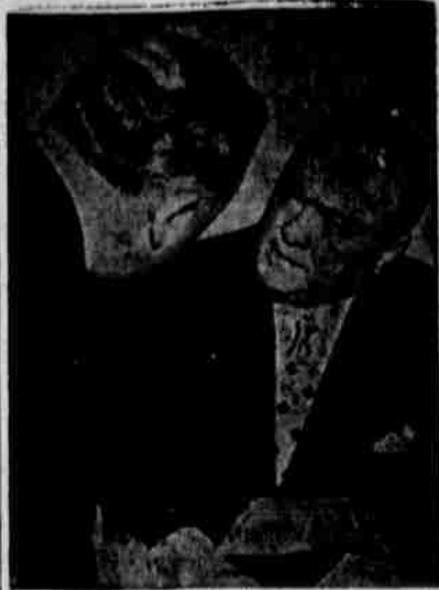
DISCUSS ATOMIC SECURITY . . . Sen. Erlen McMahon, chairman of the atomic energy committee (left), asks F. B. I. Chief J. Edgar Hoover what steps the U.S. must take to safeguard against further thefts of atomic and hydrogen bomb secrets.