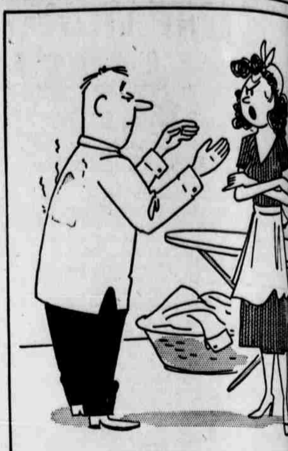
"... And Kindly Notice The Collar And Cuffs. Not A Wrinkle In Them!"