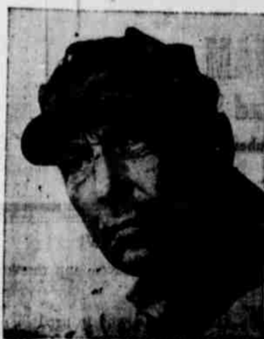
Rear Admiral Arthur W. Radford, USN, commanded a Pacific Fleet carrier task force at Tarawa. He is shown on the bridge of his flagship.