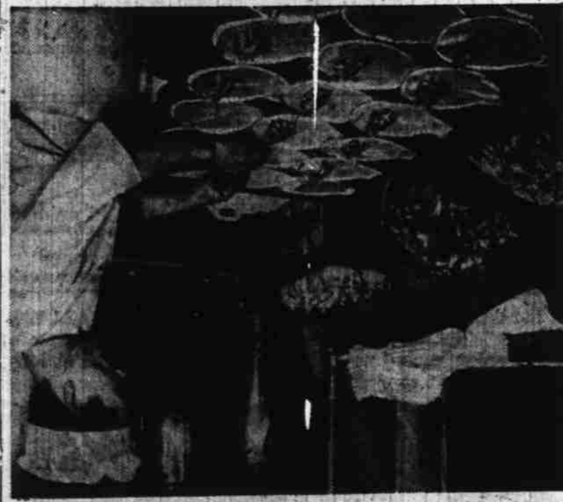
AN OLD CHINESE CUSTOM... Egg rolls, native style...