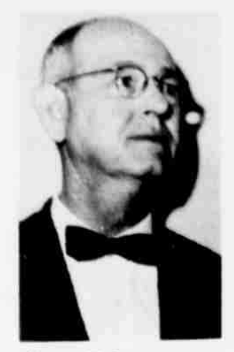
Federal Land Bank