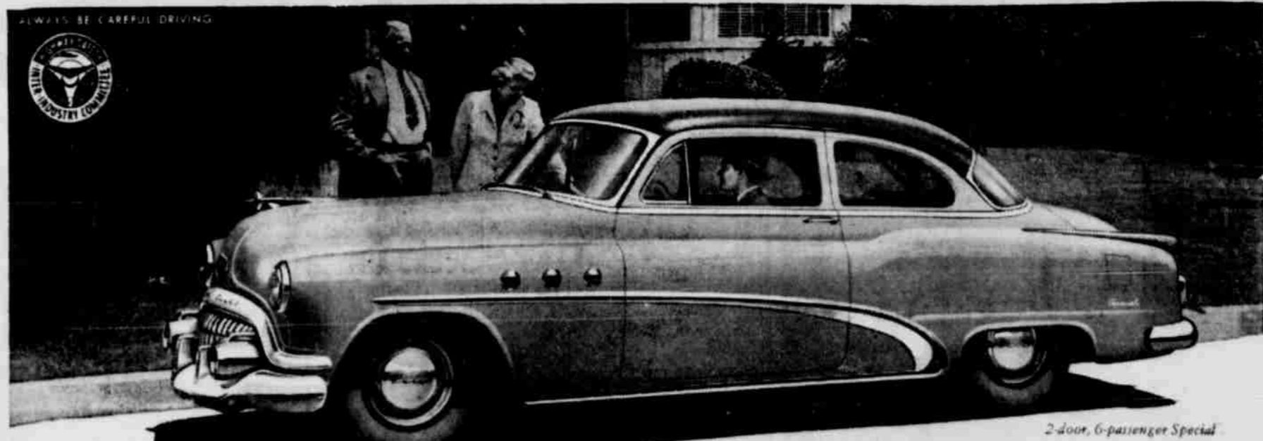
2-door, 6-passenger Special

On the Curve at Highways 51 and 84 LITTLEFIELD, TEXAS PHONE 111