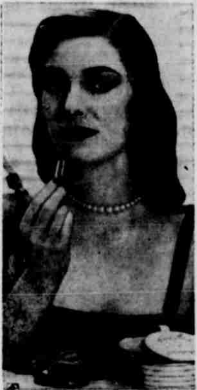
LET THERE BE LIGHT—She'll have no fear of light wearing new makeup, said to erase hollows and shadows.

By BETTY CLARKE AP Newfeatures Beauty Editor