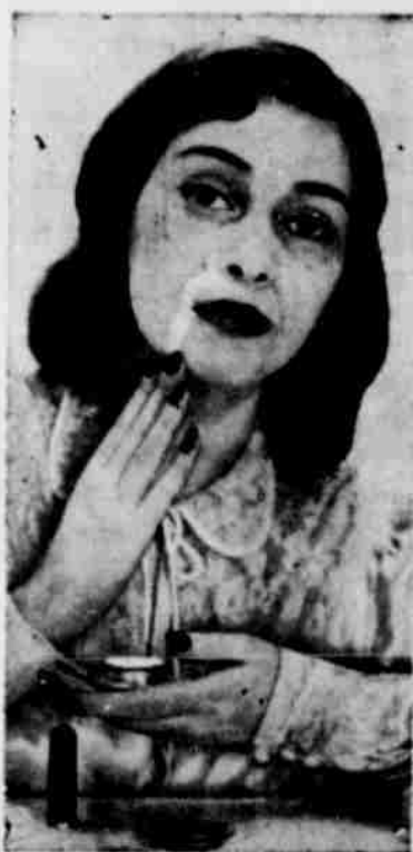
BEAUTY AID—Apply creamy substance with moistened finger to area around lips and nostrils.