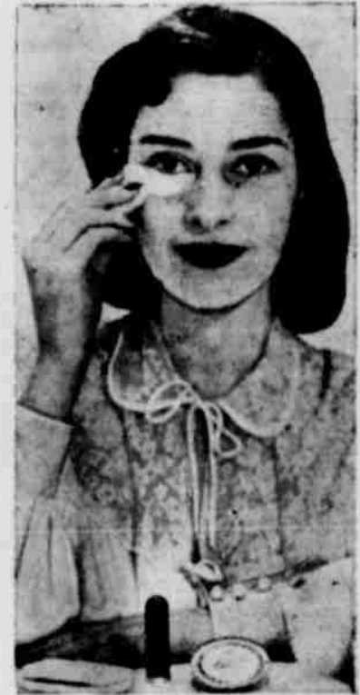
UNDER-EYE GLAMOR — To erase hollows apply cream under eyes. Smooth with a dry sponge.