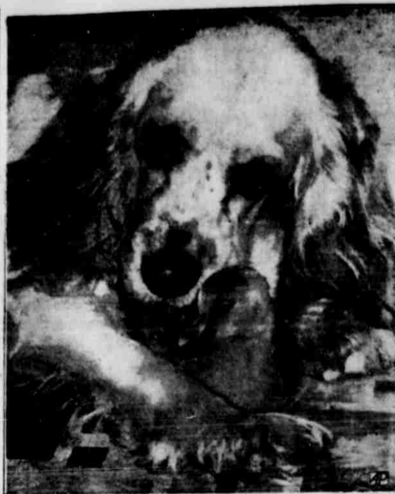
DOG IS MOM TO GOSLING —Tallulah, year-old cocker spaniel, cuddles close to her adopted offspring, a four-day-old gosling. The sad-eyed pup recently mothered another gosling, but the