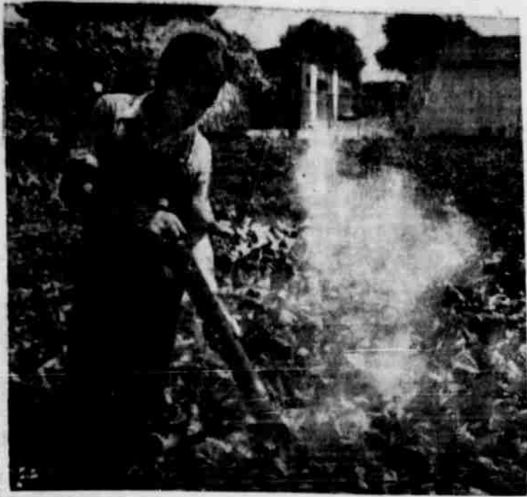
Frequent Dusting will keep you ahead of garden pests

CYNTHIA LOWRY Newspaper Writer It is determined to have a garden automatically inherit the ills and pests plants in its nature and man prepared to provide the garden with a pretty adequate arsenal of weapons with which to wage war on these pests, although it's practically a full-time job. There are also a few insects which the gardener should learn to recognize and which are the weevil, the praying mantis, the orange spotted bug and the dragonfly. These devour insects dine on aphids. Are Natural Allies The gardener's greatest natural ally is the bird family, which consumes many times as many insects as it does in the course of its life. All of which are likely to attract birds as well as a pleasant surprise. It is impossible, in a short time, to list the gamut of protection. New chemical compounds are appearing regularly, many of which are as effective as the old ones, but they are used unwisely, and particularly those of the family, should be used in accordance with the printed instructions to the exact letter. Extra care should be taken in the use of some of the newer types of poisons which are entering their stom-achs, which siphon up the plant juices, are best