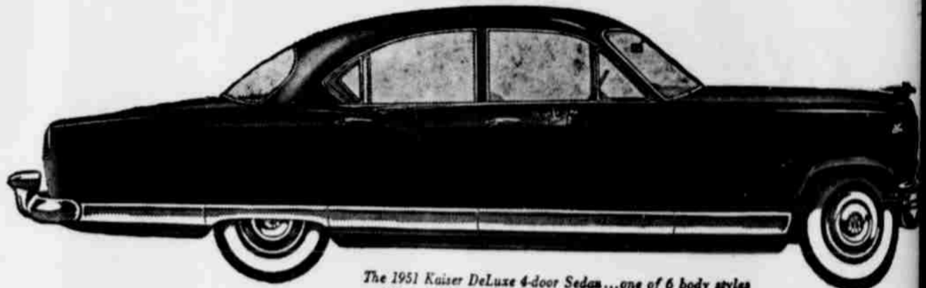
The 1951 Kaiser DeLuxe 4-door Sedan...one of 6 body styles and 12 models. Hydra-Matic Drive available in all models at extra cost.

★ Anatomic Design... (Ana-TOM-ic)... is the newest, most advanced step in motor car making. It is the principle of engineering the anatomy of the car, every feature of the body and chassis, to suit the needs of human anatomy in a way never before achieved. It results in a car that is easier to control, more comfortable, safer for you and your family to ride in.