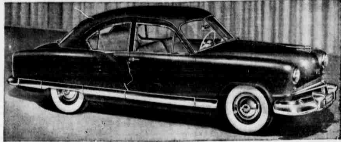
THE FIRST 1951 KAISERS have arrived at the local Kaiser-Frazer Dealers, Batson Motor Company. They comprise the second of three complete new lines of Kaiser-Frazer automobiles to be delivered this year. The medium priced Frazers reached showrooms around the country in April, and the Company's forthcoming low priced model is due in July. Above is the Kaiser Two Door Sedan, one of a complete range of 12 body types in the popular priced series. Batson Motor Company will have on display Wednesday a four-door Oakland Brown Sedan.